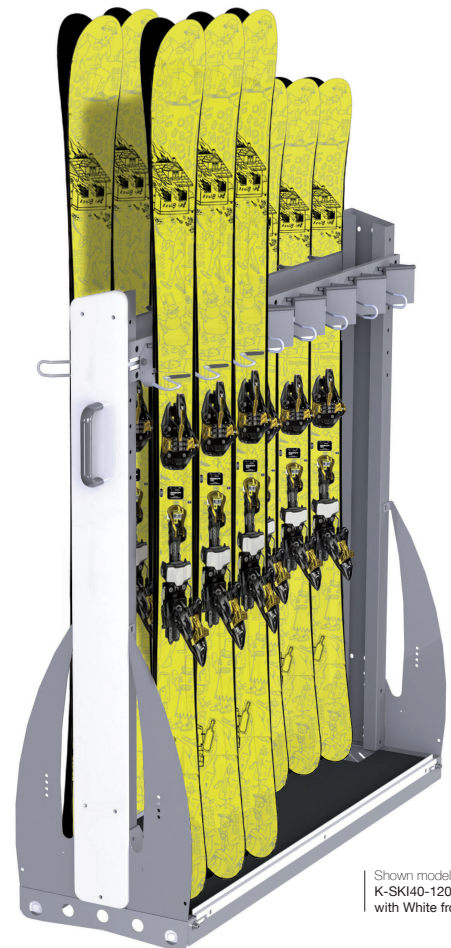
Shown model K-SKI40-120 with White front panel