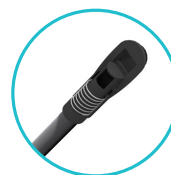
Tube with clap