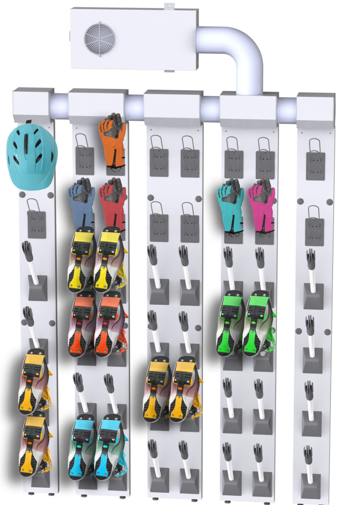
220V | Sample setting K-STOKDRY-C

+ Ventilation capacity : 350 to 500 m 3 per hour per ventilation group.