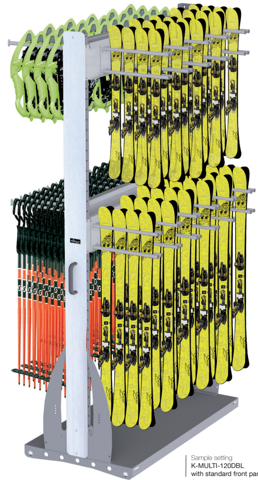
Sample setting K-MULTI-120DBL with standard front panel