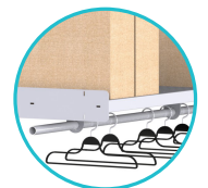
Shelves and wardrobe