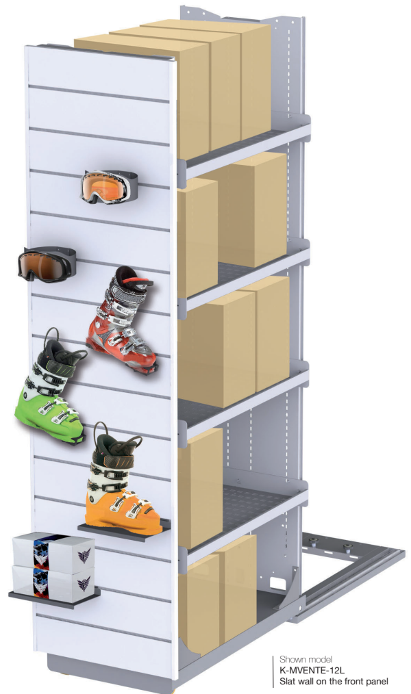
Shown model K-MVENTE-12L Slat wall on the front panel